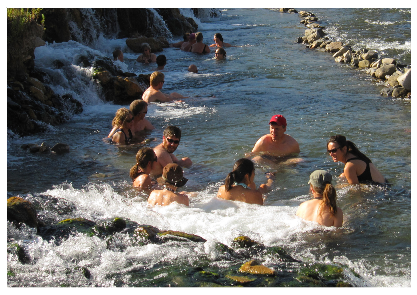
Present day soakers enjoying a hot springs as it mixes with cooler river water in Yellowstone National Park just south of Gardiner, Montana.

Prohibition, fires, an earthquake, and lack of sufficient revenue led to the destruction and closure of several of these magnificent spas, and those hot springs resorts remaining in Montana saw a decrease in visitors from the 1940s through the 1970s. But many of Montana's hot springs have seen a resurgence in the past 20 years as visitors rediscover the pleasure of soaking in Montana's soothing hot water.