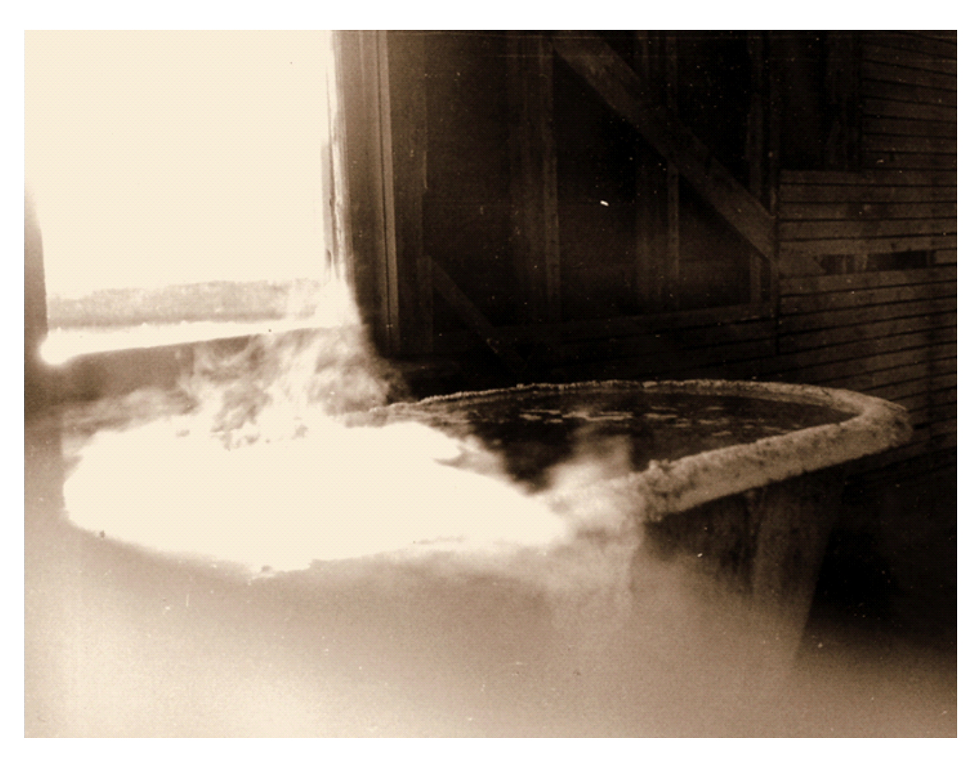
Cast iron tub filled with steaming water at Angela Flowing Well in eastern Montana, circa 1970.

During Montana's gold rush years in the 1860s to the early 1880s, crude hot springs bathhouses and guest cabins were built near many of Montana's geothermal resources in the western part of the state. Bathhouses built near the towns of Emigrant, Virginia City, Boulder, Clancy, and Helena all served as gathering places for gold prospectors, while cast-iron tubs in a log cabin offered cowboys a bath at a hot water well drilled in eastern Montana in the 1930s.